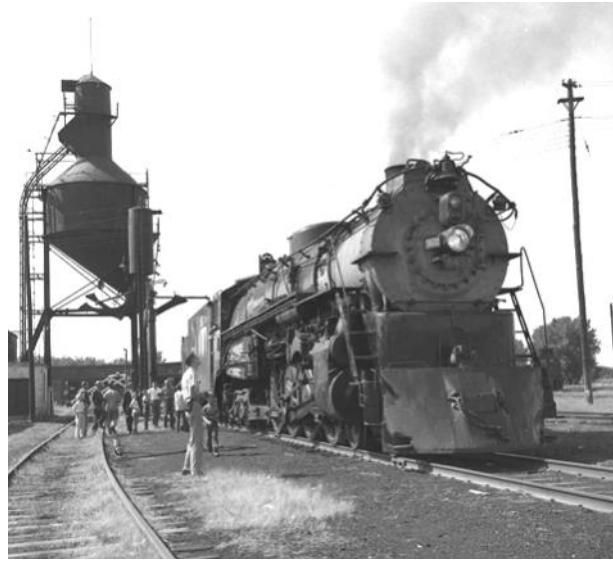
La Crosse WI CBQ #5632 No Date Given