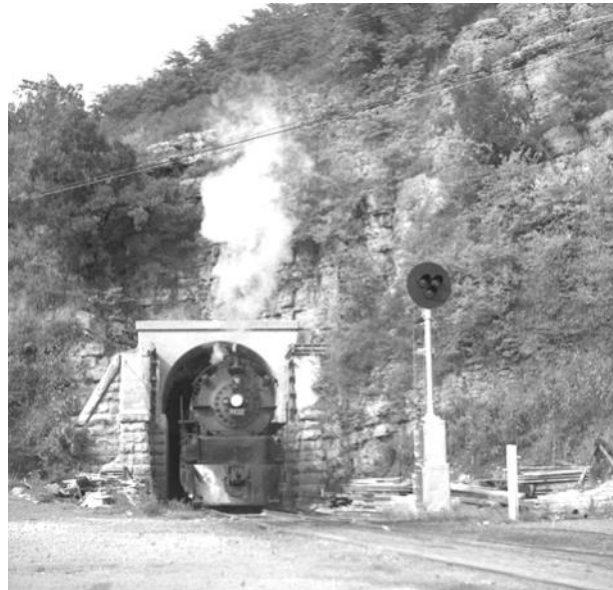
East Dubuque, IL CBQ #5632 No Date Given