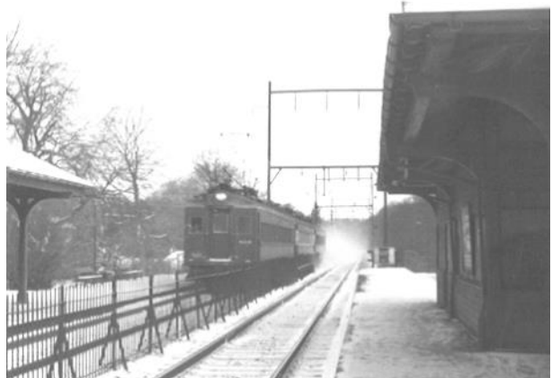
A Reading Company electric M.U. train kicks up snow at Elkins Park station in the early 1970s.