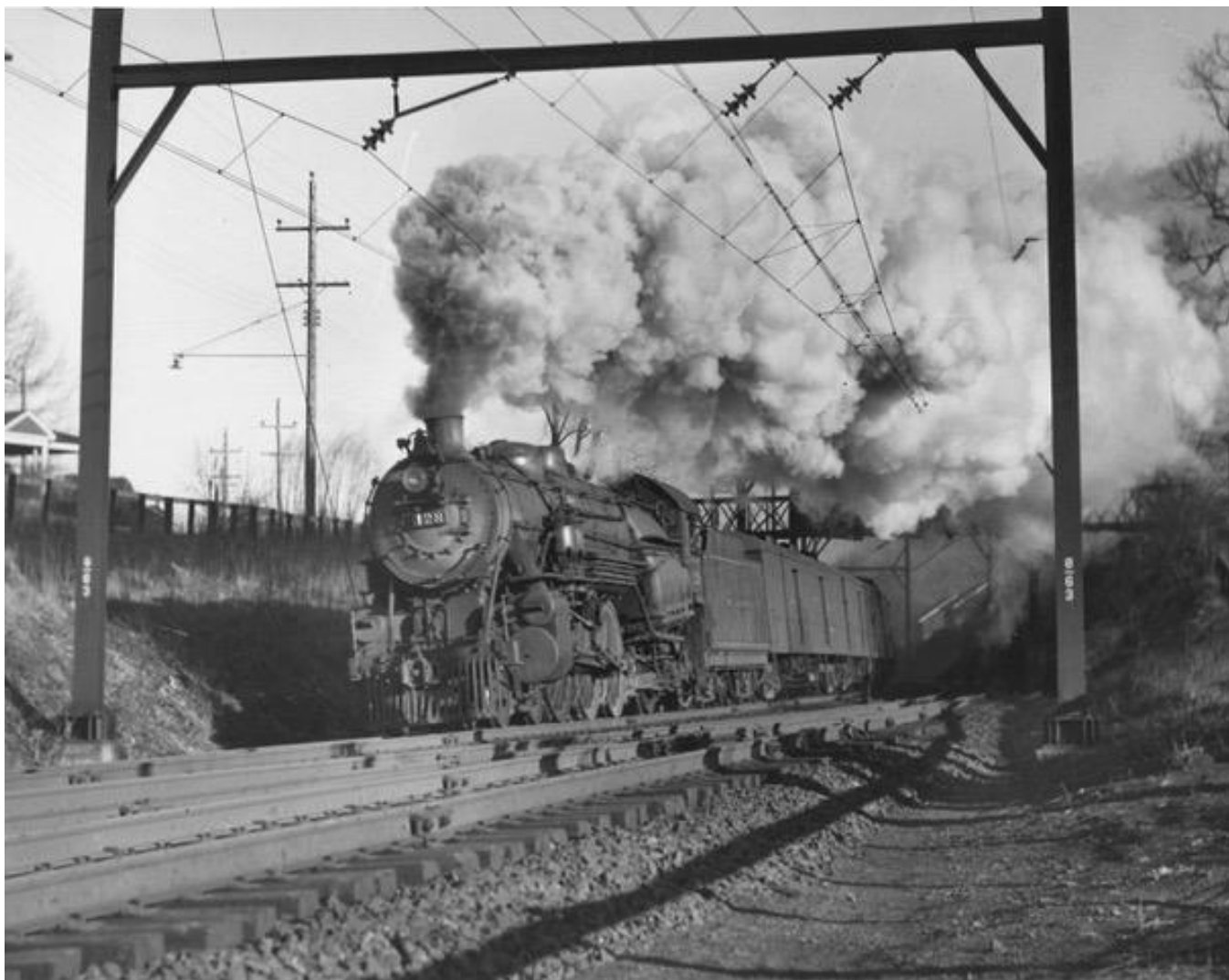
Reading 4-6-2 No. 128 is between Elkins Park and Oak Lane stations as it speeds south with a New York express in the 1940s.

Visit the Chapter Webpage www.nrhswis.org