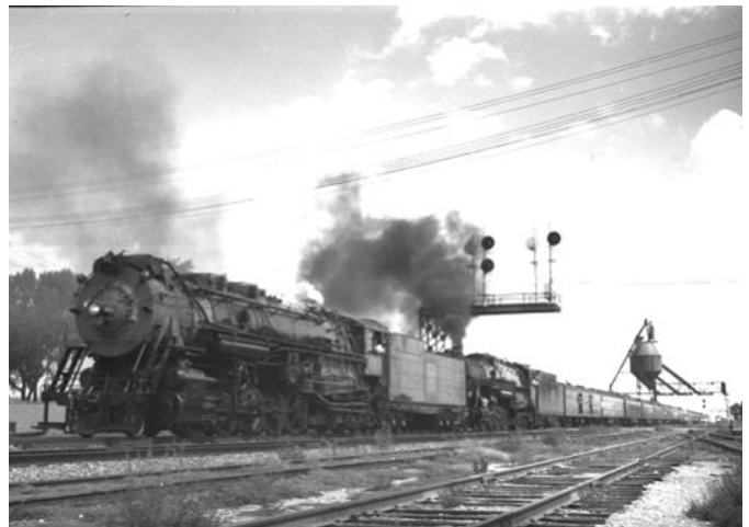
6 Doubleheader Westbound on CBQ at Mendota, IL