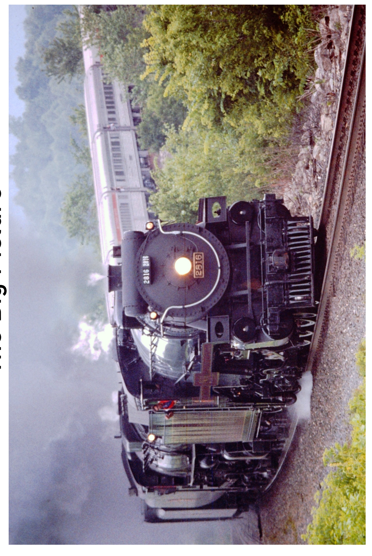
The Canadian Pacific #2816 leads Milwaukee Road #261 rounding the curve at Winona MN on July 3 2004.