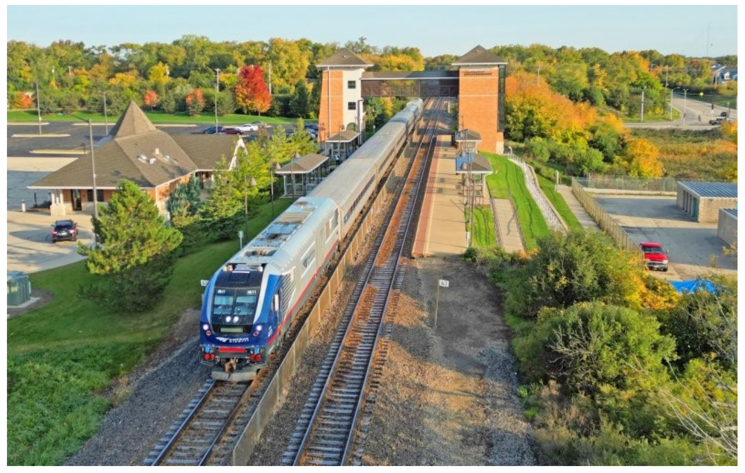
Amtrak Hiawatha with a Charger leading departs Sturtevant depot heading north towards Milwaukee.

Visit the Chapter Webpage www.nrhswis.org