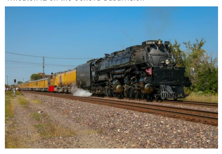
Chicago Heights IL on the Villa Grove Subdivision