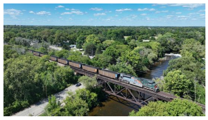
Crossing the Milwaukee River in Glendale WI north of Bender Road