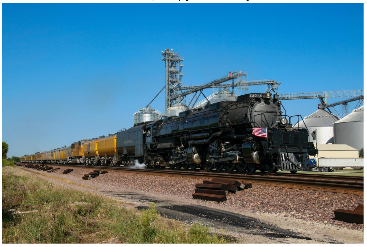
UP #4014 "Big Boy" leads the "Heartland of America Tour" train eastbound at Meredith IL on the Geneva Subdivision September 9 2024

Visit the Chapter Webpage www.nrhswis.org