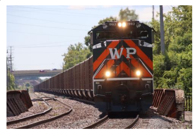
Rounding the curve crossing over Capitol Drive about the enter Butler Yard.