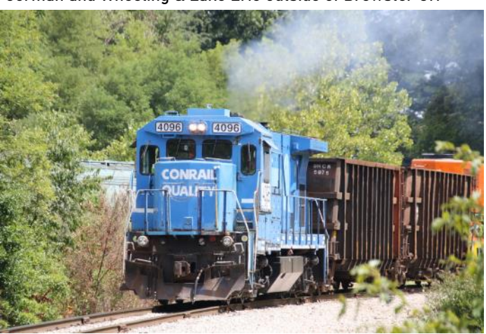
Ohio Central #4096 a Super 7 leads a local train near Zaynesville OH. In full Conrail paint this might be a former Monongahela railroad unit.