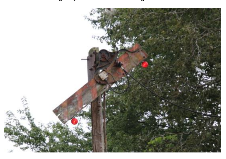
A classic "tilt board" signal protects a diamond between RJ Corman and Wheeling & Lake Erie outside of Brewster OH