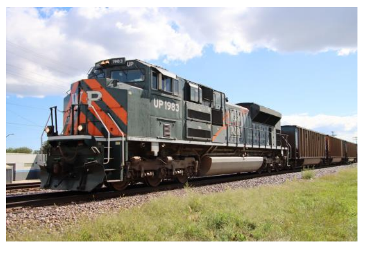
Working hard climbing the .8% grade through West Allis. It was just two locomotives on the loaded train.

Using several Facebook groups to track its location myself and friend Dan Larkee were able to catch the train several times. We also ran into some fellow chapter members including Jerry Krug and Patti. A few photos from the chase below.