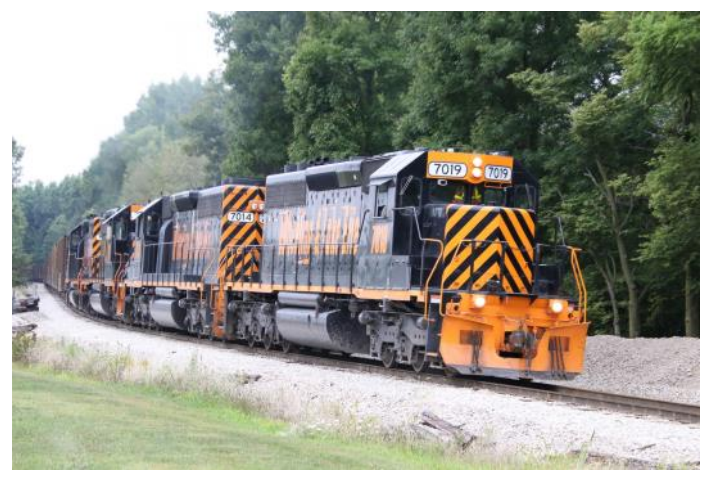
A matched set of 4 Wheeling and Lake Erie SD40-2 leads a rock train through Sycamore Ohio on August 18 2024

I joined Dan and Tara for a railfan trip August 19-22 2024. We investigated Ohio and Indiana area for shortline and regional railroads. We were successful. We saw the Wheeling and Lake Erie, Ohio Central and Louisville and Indiana railroads. Plus action from some of the class I railroads including CSX and NS. Below are some photos from the trip.