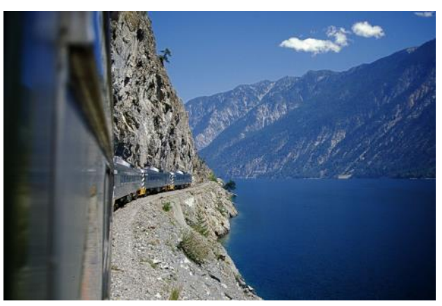
BC Rail RDC Train rolls along Seton Lake British Columbia