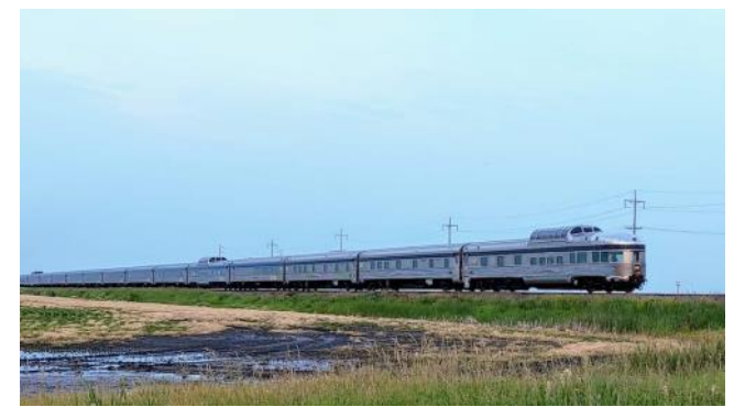
VIA Train #2 the eastbound Canadian rolls toward Winnipeg at sunset July 2024