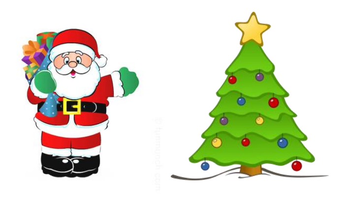
Happy Holidans and Happy New Year!!

THANK YOU!! For supporting the chapter and purchasing the 75th anniversary apparel and wearing it proudly.