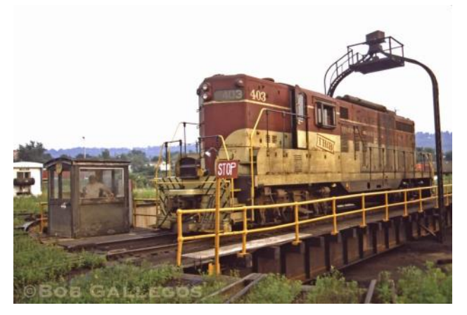
TH&B #403 rides the turntable at Hamilton Ontario