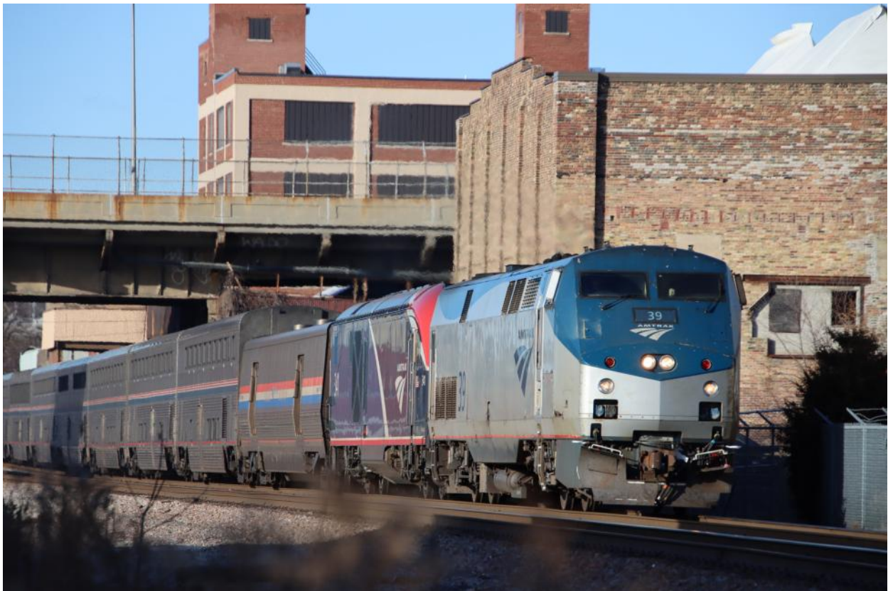
Wait a minute. Eastbound Amtrak #8 with the sun on it's nose. Somethings not right. Saturday January 18 2025. #8 was running about 19 hours late at 10am when it arrived in MKE. The passengers got an extra night on the train.