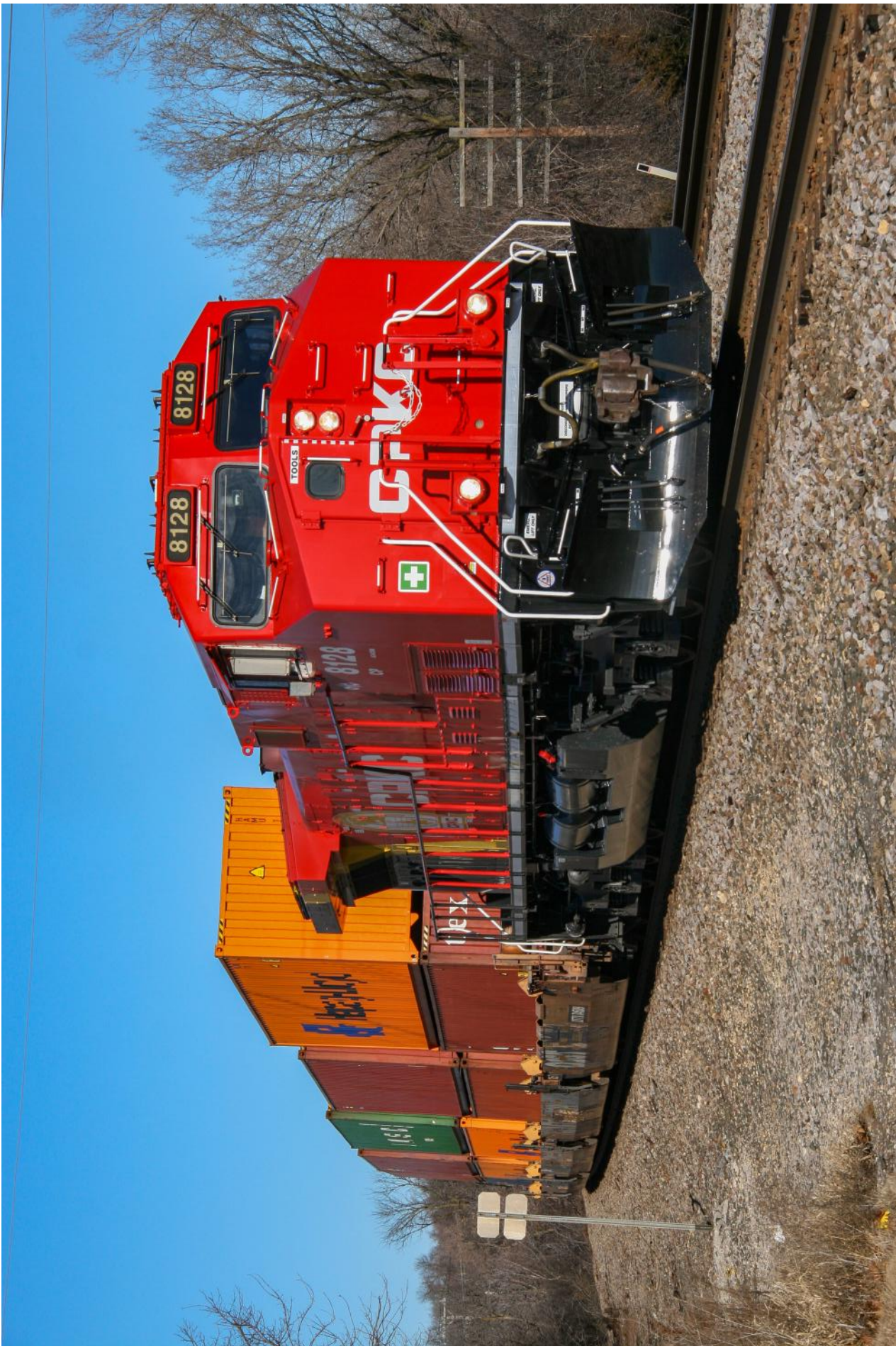
CPKC #8128 shows off the new CPKC paint job on Saturday January 4 2025. #8128 is leading the eastbound CPKC Train #148. The location is a familiar one to many in Milwaukee. When it was the Milwaukee Road it was Powerton. Now it's grade crossing for Waterford Ave.