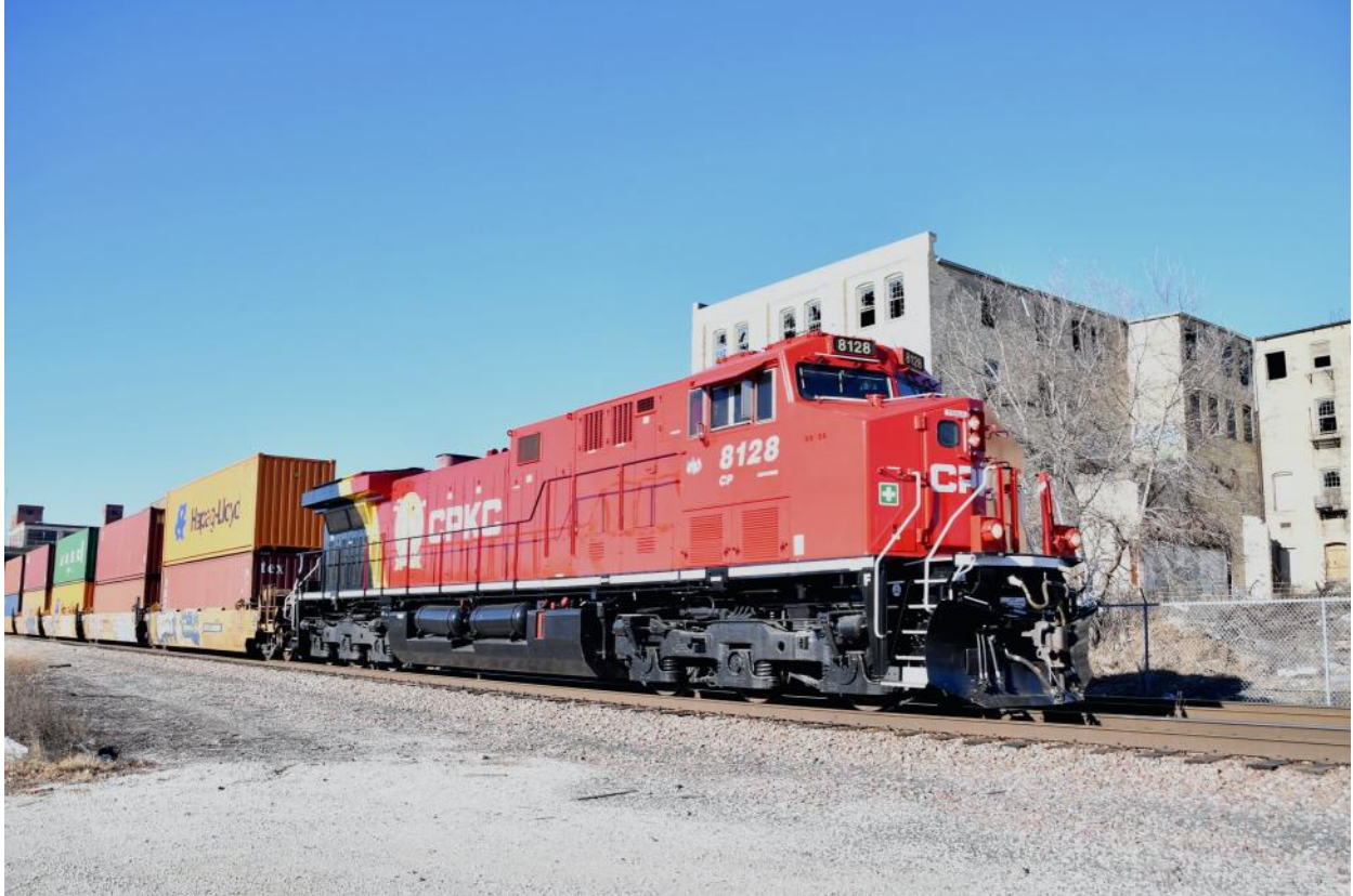
CPKC #8128 features the new paint scheme for the railroad. The AC44CWM was leading the eastbound intermodal train #148 west of the depot. Taken from Mt Vernon Ave.