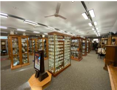
Small portion of the railroad china

Where Christopher Farm and Gardens W580 Garton Road Sheboygan WI