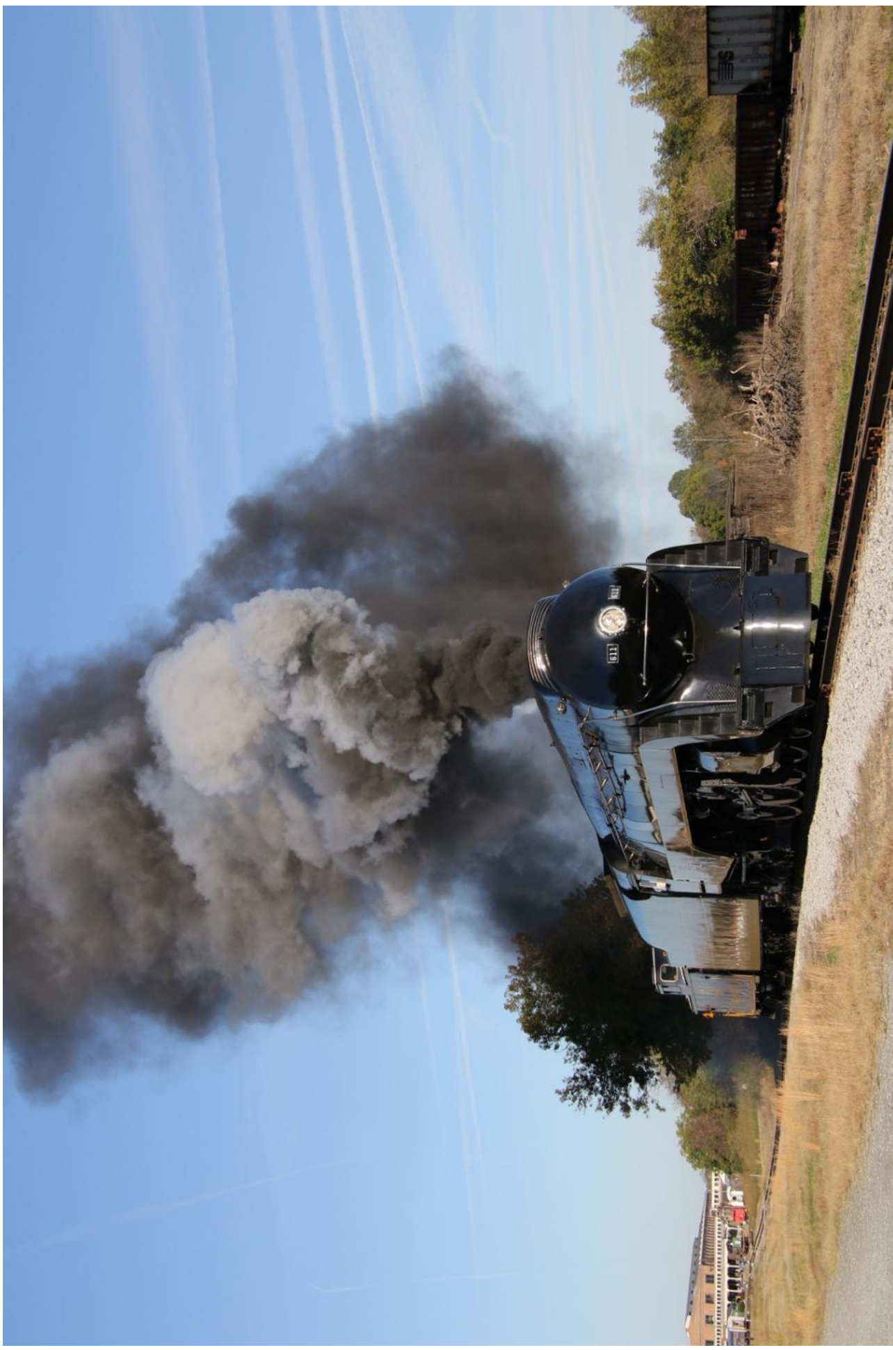
Also turning 75 years old the Norfolk and Western #611 is the Queen of Steam., Here the #611 is at Spencer NC at the Railroad Museum in Oct 2021.