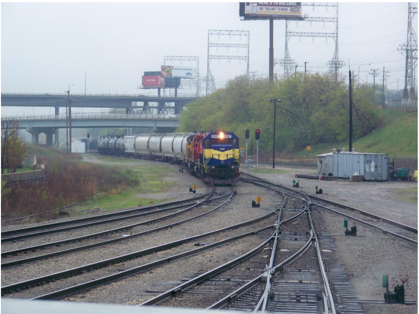
At Cut Off in the Menominee Valley. DME #6367 leads an eastbound freight as seen from WSOR locomotive in the yard.

Visit the Chapter Webpage www.nrhwis.org