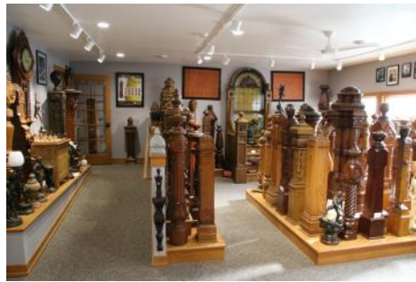
Plenty of newels on display too.