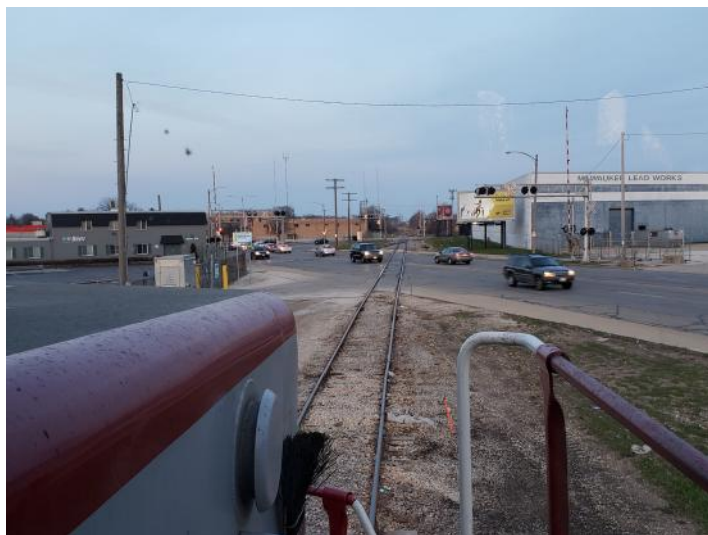
Traffic on Hampton Ave crosses the WSOR on what is a remnant of the old Beer Line. This is looking east.