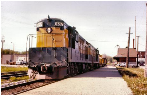
CNW #1697 at Marinette WI

We'll be at our usual meeting place, the North Shore Congregational Church, 7330 North Santa Monica, Fox Point. For those unable to travel to Fox Point, the meeting will also be streamed, via the Zoom platform. Information regarding the Zoom meeting link will be sent out a week or so before the meeting. To register for the Zoom meeting or to become a member of the Wisconsin Chapter and support these presentations check out www.nrhwis.org .