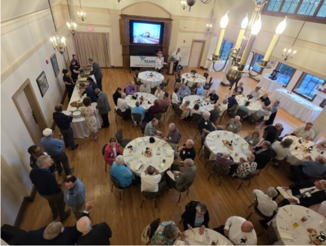
A view from above at a great dinner with great friends old and new.