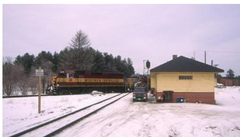
WC #531 at Pembine WI