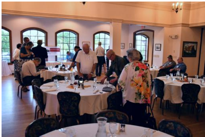
Enjoying some stories and fellowship before the banquet