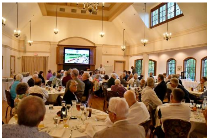
All seated as the banquet begins