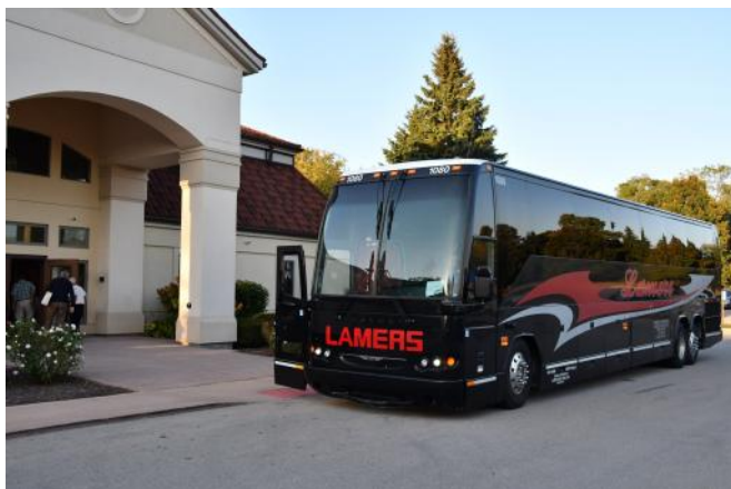
Guests arriving from NRHS Conference