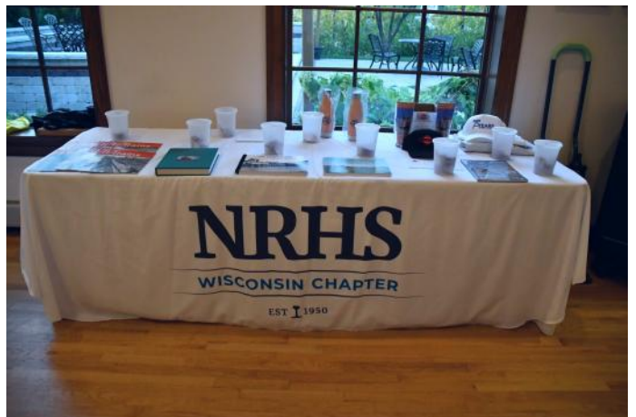
A table of door prizes given away at the banquet. The door prizes were donated by several great supporters of the chapter.