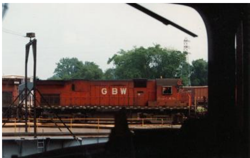
GBW "Homer McGhee" at Norwood Yard Green Bay WI