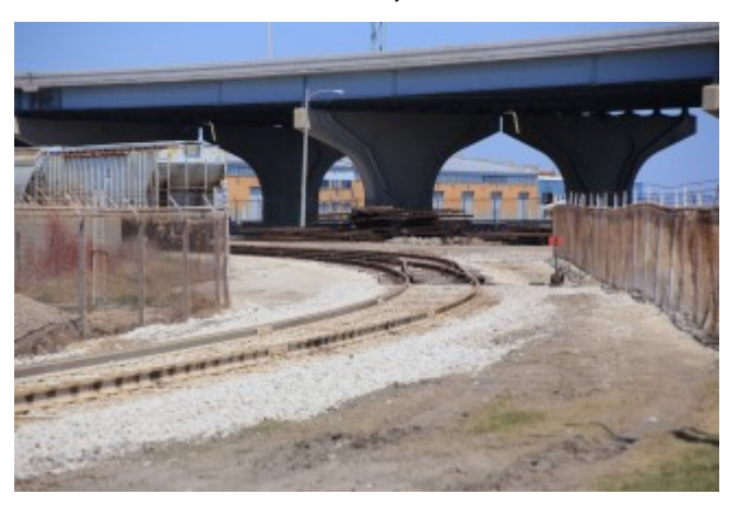
Some new rail laid on the track connecting the east and west sides of the harbor.