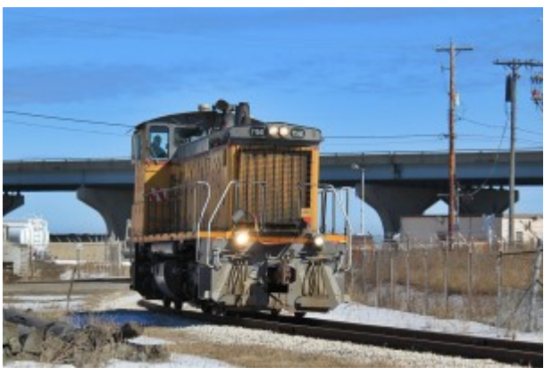
UP switcher on the connection track on Jones Island June 2010